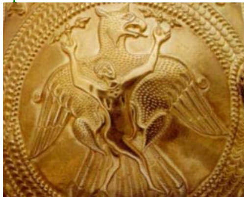
The treasure of Nagyszentmiklós