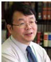
Hideo Hosono Tokyo Institute of Technology Japan

Progress in Doping Issues for Optoelectronic Transparent Crystalline and Amorphous Oxides